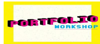
Art Academy Virtual Portfolio Workshop Saturday, November 14