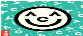
Art Academy Virtual Classroom Visits Now-Dec. 11